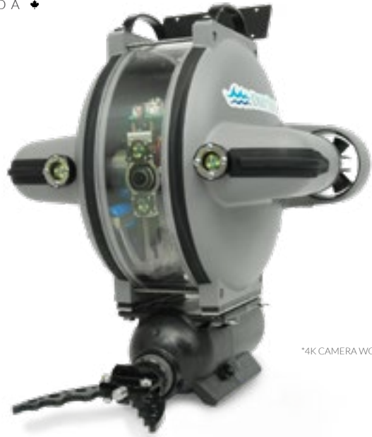
*4K CAMERA WORKER AUX LIGHTS