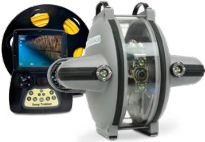
*4K CAMERA SMART AUX LIGHTS